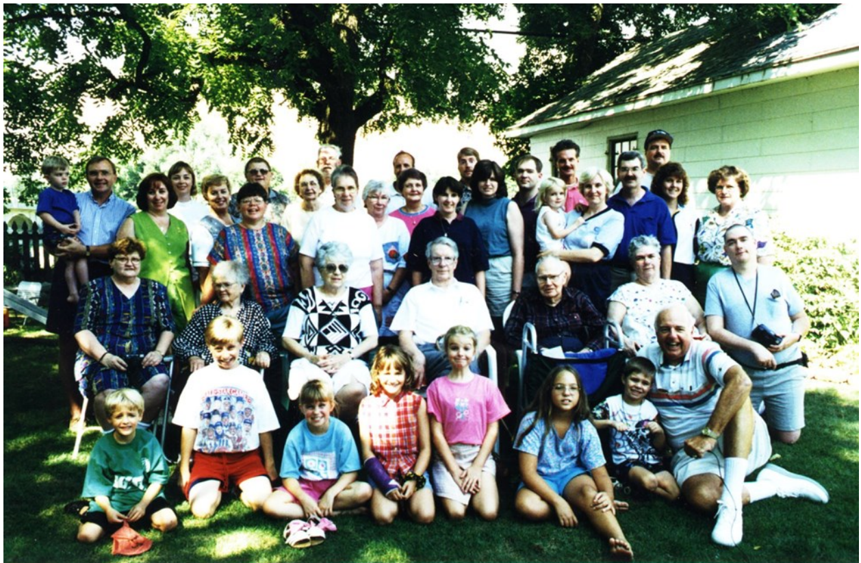
1997 Tossey Family reunion, Troy, Ohio